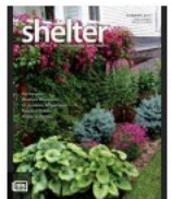
SPECIAL SECTIONS Shelter Jun 5, 2023