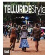
SPECIAL SECTIONS Telluride Style Jun 7, 2023